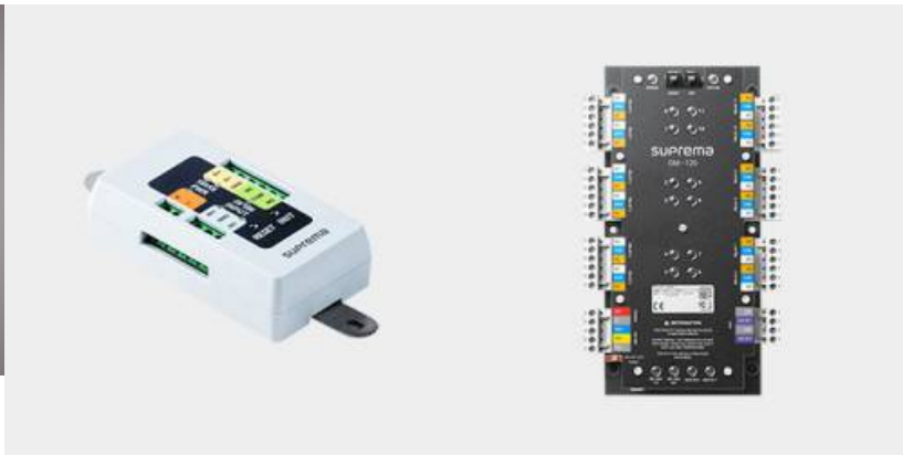
Secure I/O 2