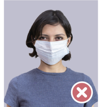
Wearing a mask covering your nose up to the nose bridge