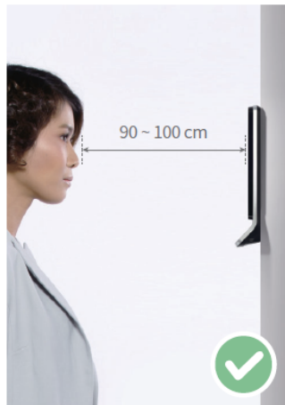
Stand at a distance of 90-100 cm from the device.