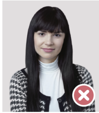
Covering your forehead or eyebrows