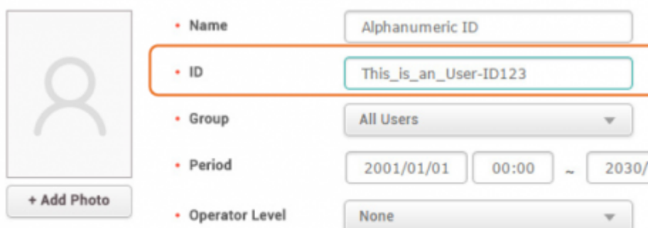
[Alphanumeric ID input screen]

The length of the user ID can be up to 32 characters long.