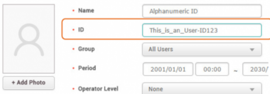
[Alphanumeric ID input screen]

In BioStar version 2.4 and above you can use alphanumeric user IDs. This means you can have a user ID with alphabets and special characters of hyphen (-) and underline/underscore (_). The length of the user ID can be up to 32 characters long.