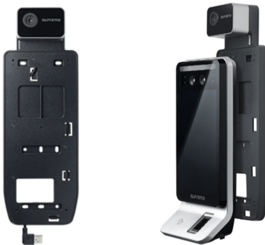
Suprema Thermal Camera TCM10-FSF2

1. Connect TCM10-FSF2 product to FaceStation F2. Refer to the photo below for the bracket sample and thermal camera product.