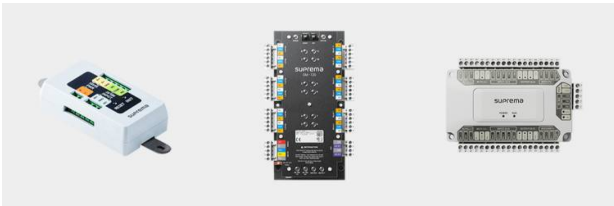
Secure I/O 2