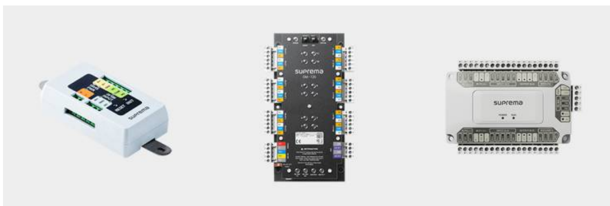
Secure I/O 2