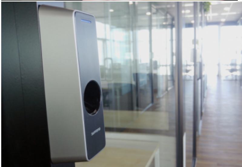
[BioEntry W2 ]

From: http://kb.supremainc.com/knowledge/ -