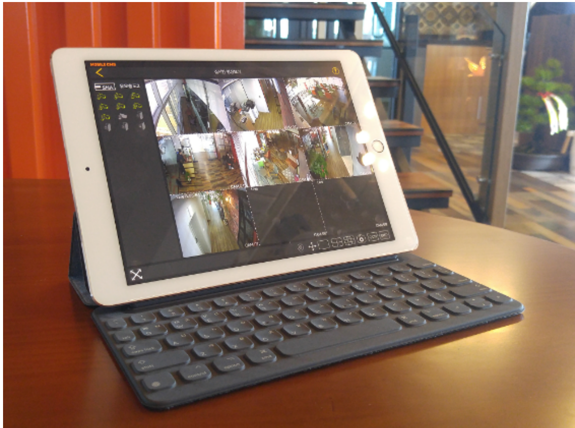
[X-View Mobile ]